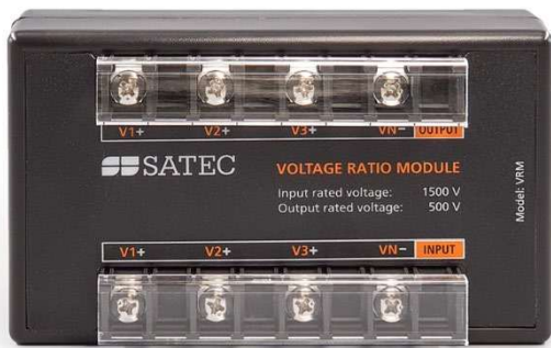
Figure 2: VRM Module